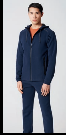
01 PD ESSENTIAL TEE / AUBURN / 4046901976934 02 PD SWEAT HOODIE / NAVY BLAZER / 4046901138424 03 PD SWEAT PANTS / NAVY BLAZER / 4046901505431 04 PD HYBRID TOURER WTR / AUBURN / 4046901516475