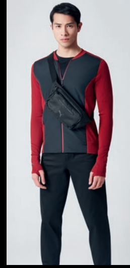
01 PD INSULATED BOMBER JACKET / RED DAHLIA / 4046901982218 / 02 PD X-BODY BAG / JET BLACK / 4046901966652 / 03 PD 5 POCKET PANTS / JET BLACK / 4046901966683 / 04 PD OCTN HIGH / JET BLACK / 4046901516864