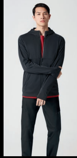
01 PD ESSENTIAL TEE / RED DAHLIA / 4046901979621 02 PD TRAVEL HOODIE / JET BLACK / 4046901870492 03 PD CARGO PANTS / JET BLACK / 4046901967642 04 PDSPEEDCAT JAMMING / RED, BLACK / 4046901699994