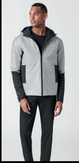
01 PD RCT TEE / JET BLACK / 4046901129569 / 02 PD RCT JACKET / GLOW IN THE DARK / 4046901129507 03 PD 5 POCKET PANTS / JET BLACK / 4046901966683 04 PD OCTN HIGH / JET BLACK / 4046901516864