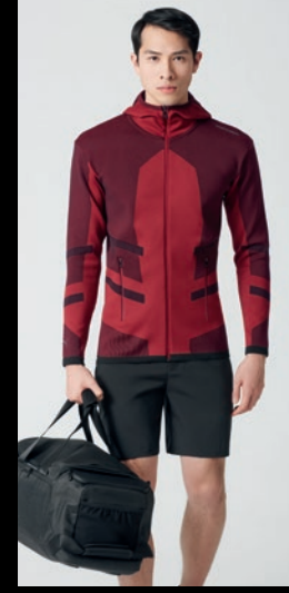
01 PD ACTIVE EVO TEE / RED DAHLIA / 4046901967109 02 PD ACTIVE EVO MID-LAYER / RED DAHLIA / 4046901966867 / 03 PD AP SHORTS / JET BLACK / 4046901637286 / 04 PD GYM DUFFLE BAG / JET BLACK / 4046901965303 / 05 PD HYBRID TRAINER II / JET BLACK / 4046901517298