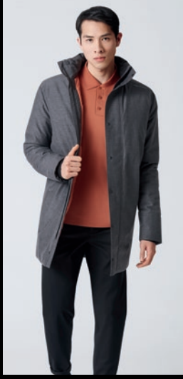
01 PD RCT TRAVEL COAT / ASPHALT / 4046901129903 02 PD ESSENTIAL POLO / AUBURN / 4046901967703 03 PD 5 POCKET PANTS / JET BLACK / 4046901966683 04 PD HYBRID TOURER WTR / AUBURN / 4046901516475