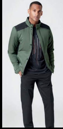
01 PD RACING JACKET / THYME / 4046901128180 02 PD GRAPHIC TEE / JET BLACK / 4046901981655 03 PD CARGO PANTS / JET BLACK / 4046901967642 04 PD OCTN HIGH / JET BLACK / 4046901516864