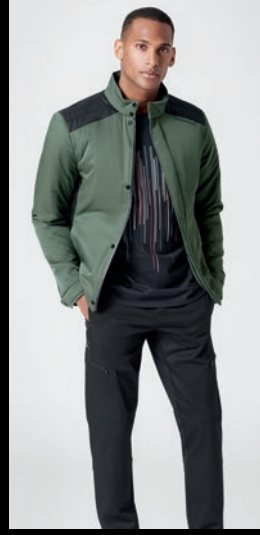
01 PD RACING JACKET / THYME / 4046901128180 02 PD GRAPHIC TEE / JET BLACK / 4046901981655 03 PD CARGO PANTS / JET BLACK / 4046901967642 04 PD OCTN HIGH / JET BLACK / 4046901516864