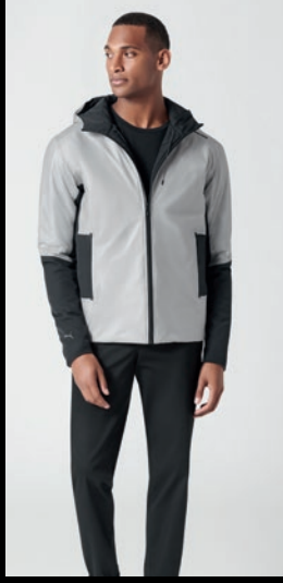
01 PD RCT TEE / JET BLACK / 4046901129569 / 02 PD RCT JACKET / GLOW IN THE DARK / 4046901129507 03 PD 5 POCKET PANTS / JET BLACK / 4046901966683 04 PD OCTN HIGH / JET BLACK / 4046901516864