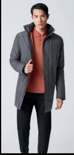
01 PD RCT TRAVEL COAT / ASPHALT / 4046901129903 02 PD ESSENTIAL POLO / AUBURN / 4046901967703 03 PD 5 POCKET PANTS / JET BLACK / 4046901966683 04 PD HYBRID TOURER WTR / AUBURN / 4046901516475