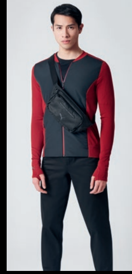
01 PD INSULATED BOMBER JACKET / RED DAHLIA / 4046901982218 / 02 PD X-BODY BAG / JET BLACK / 4046901966652 / 03 PD 5 POCKET PANTS / JET BLACK / 4046901966683 / 04 PD OCTN HIGH / JET BLACK / 4046901516864