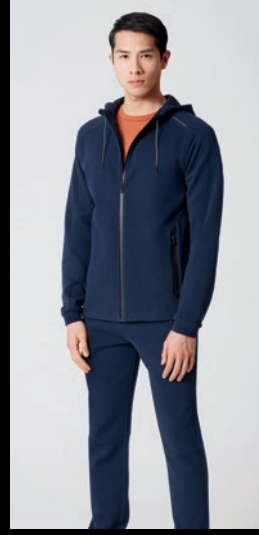
01 PD ESSENTIAL TEE / AUBURN / 4046901976934 02 PD SWEAT HOODIE / NAVY BLAZER / 404690138424 03 PD SWEAT PANTS / NAVY BLAZER / 4046901505431 04 PD HYBRID TOURER WTR / AUBURN / 4046901516475