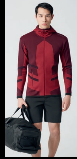
01 PD ACTIVE EVO TEE / RED DAHLIA / 4046901967109 02 PD ACTIVE EVO MID-LAYER / RED DAHLIA / 4046901966867 / 03 PD AP SHORTS / JET BLACK / 4046901637286 / 04 PD GYM DUFFLE BAG / JET BLACK / 4046901965303 / 05 PD HYBRID TRAINER II / JET BLACK / 4046901517298