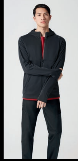
01 PD ESSENTIAL TEE / RED DAHLIA / 4046901979621 02 PD TRAVEL HOODIE / JET BLACK / 4046901870492 03 PD CARGO PANTS / JET BLACK / 4046901967642 04 PDSPEEDCAT JAMMING / RED, BLACK / 4046901699994